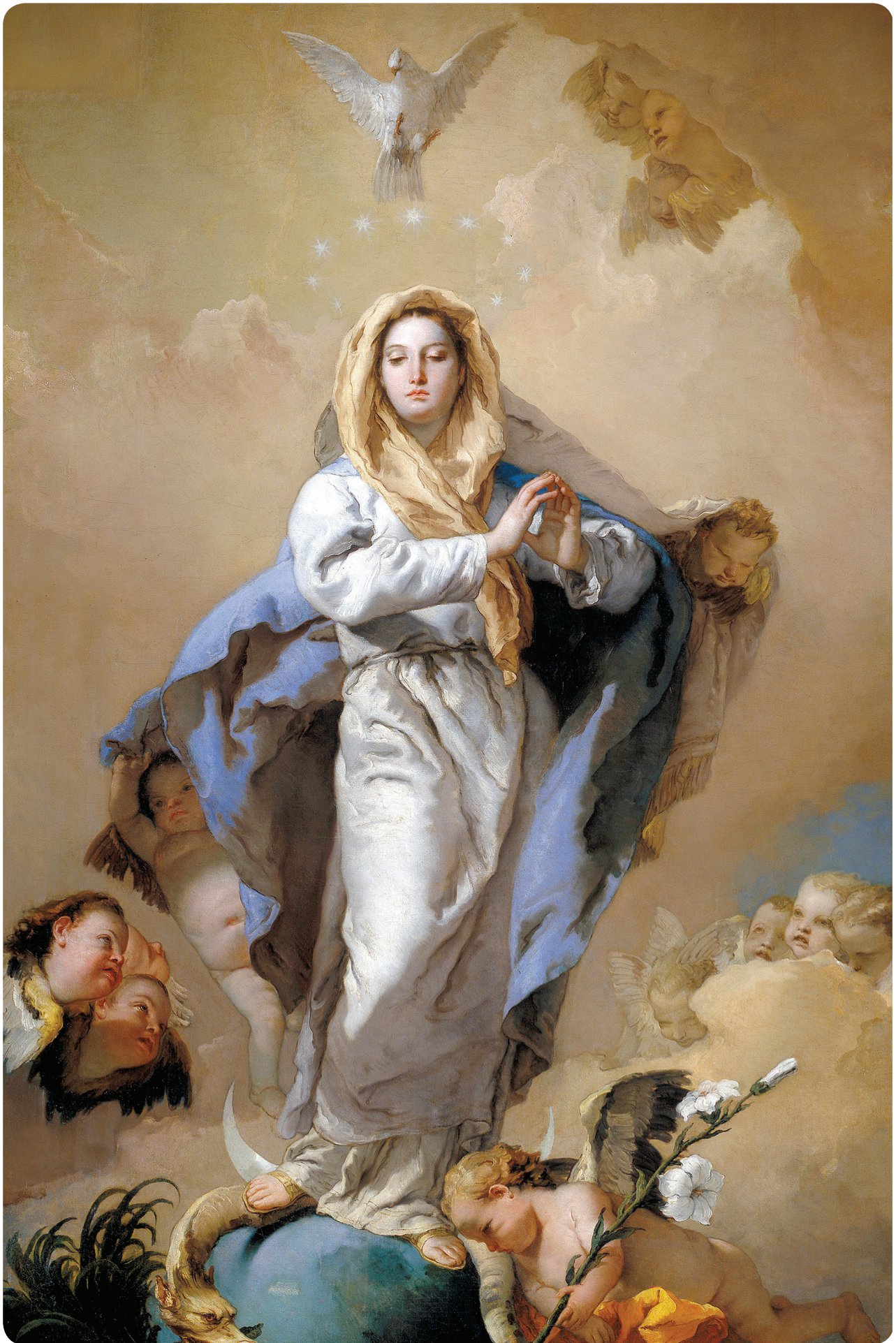
Immaculate Conception.