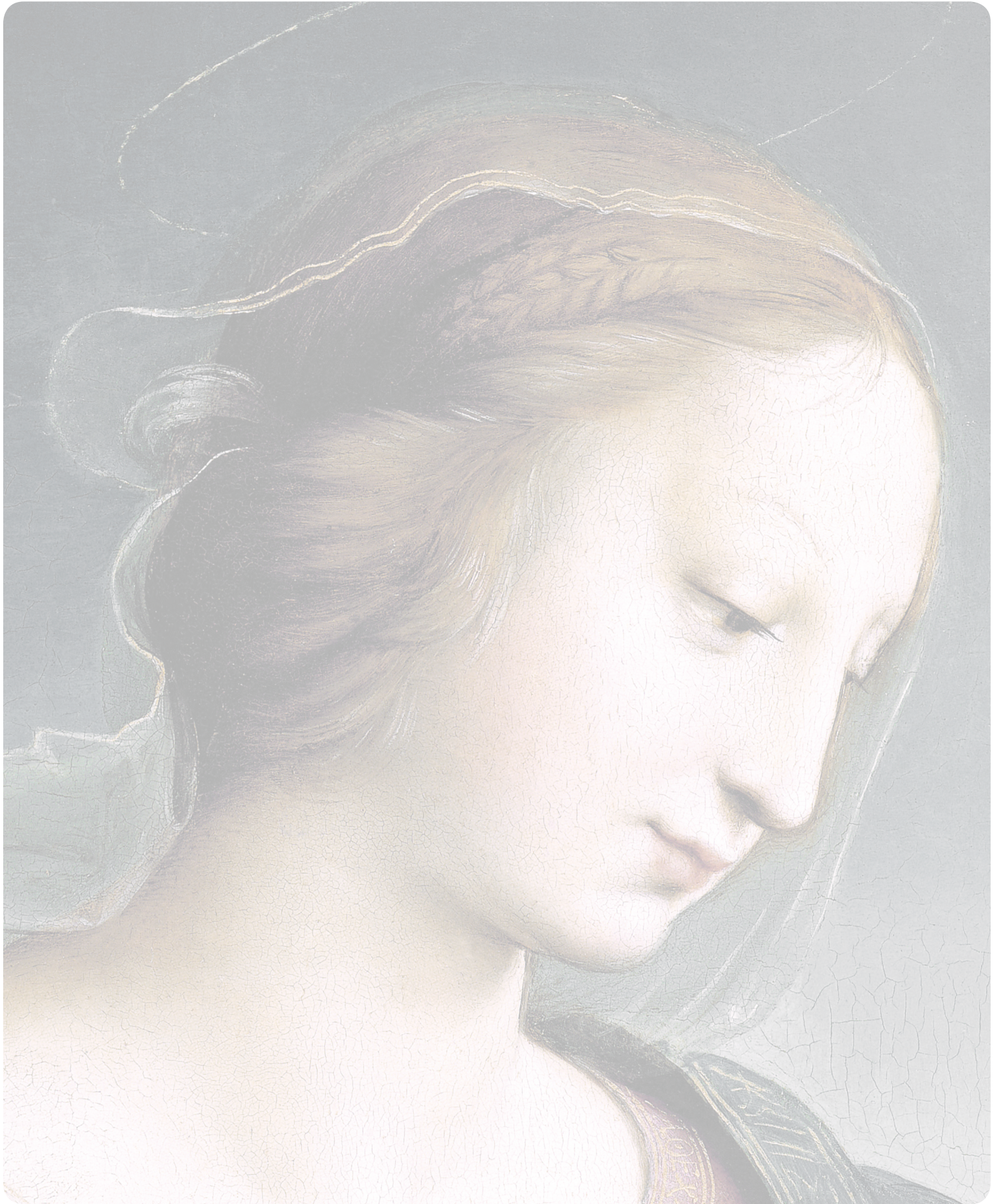
The Niccolini-Cowper Madonna, detail.