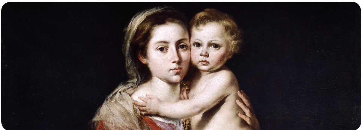
Madonna of the Rosary.

By the end of The Bible and the Virgin Mary , you’ll understand why Catholics honor Mary as the human person who most perfectly conforms to the image of God. She’s an icon of what we are to become. Let’s get started!