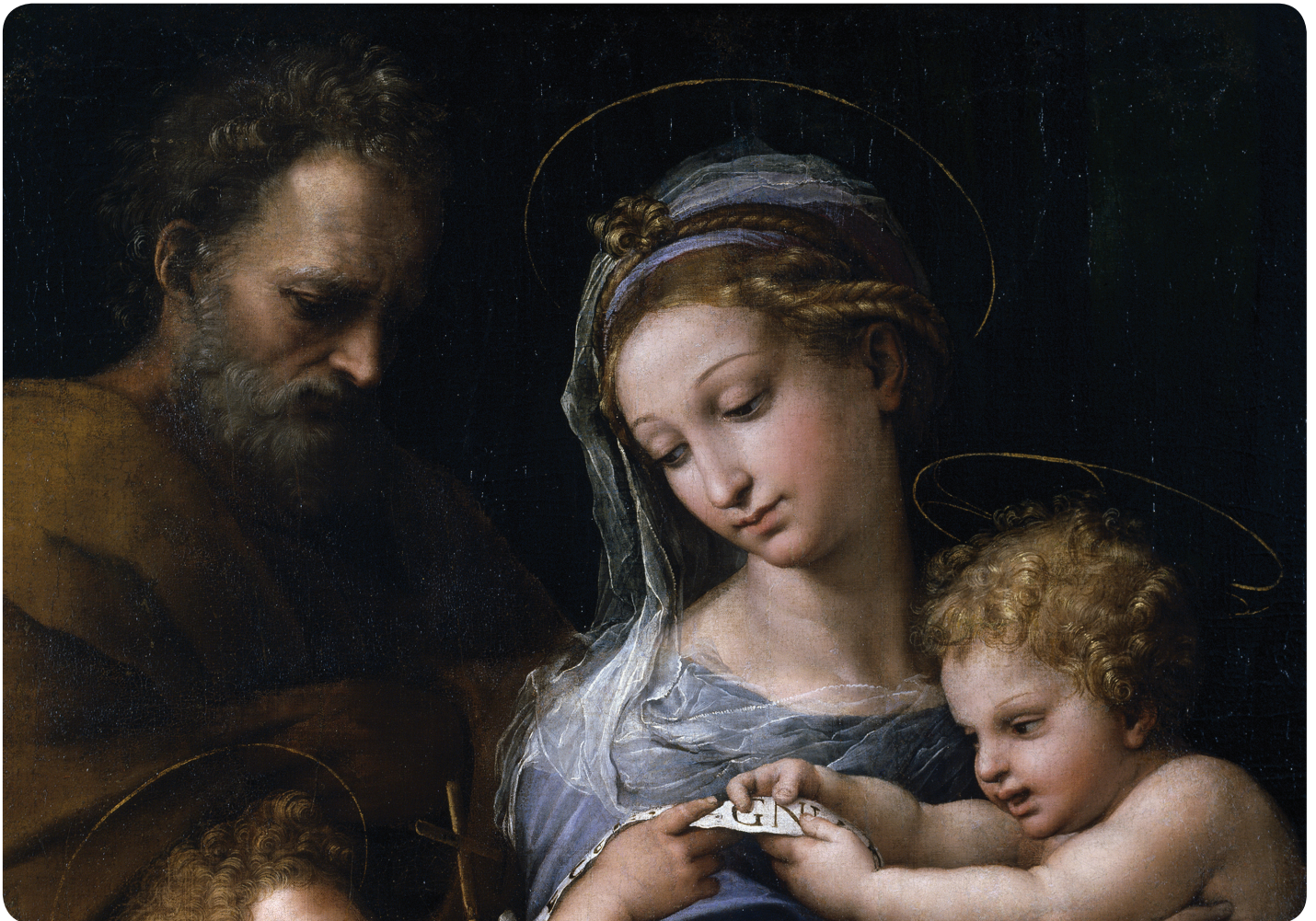
The Madonna of the Rose (Madonna della rosa).